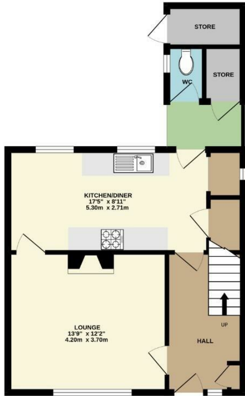
GROUND FLOOR 477 sq.ft. (44.3 sq.m.) approx.